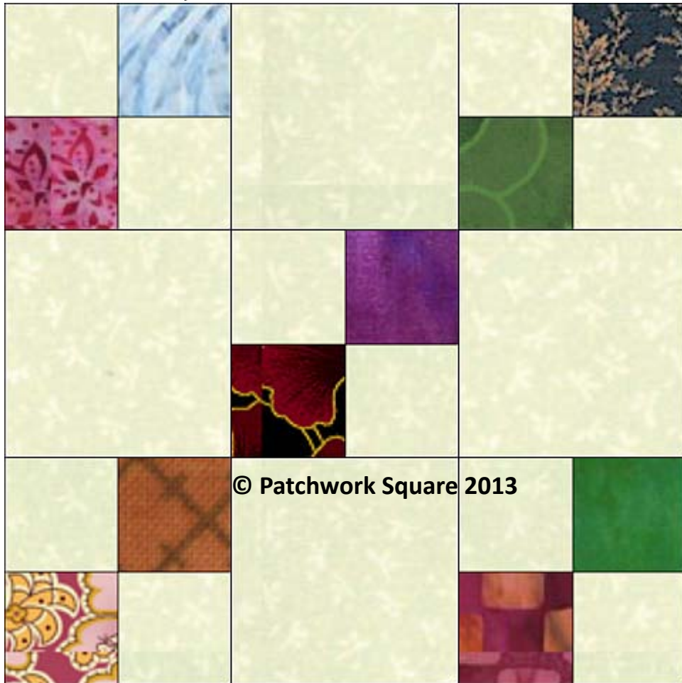
12" finished quilt block